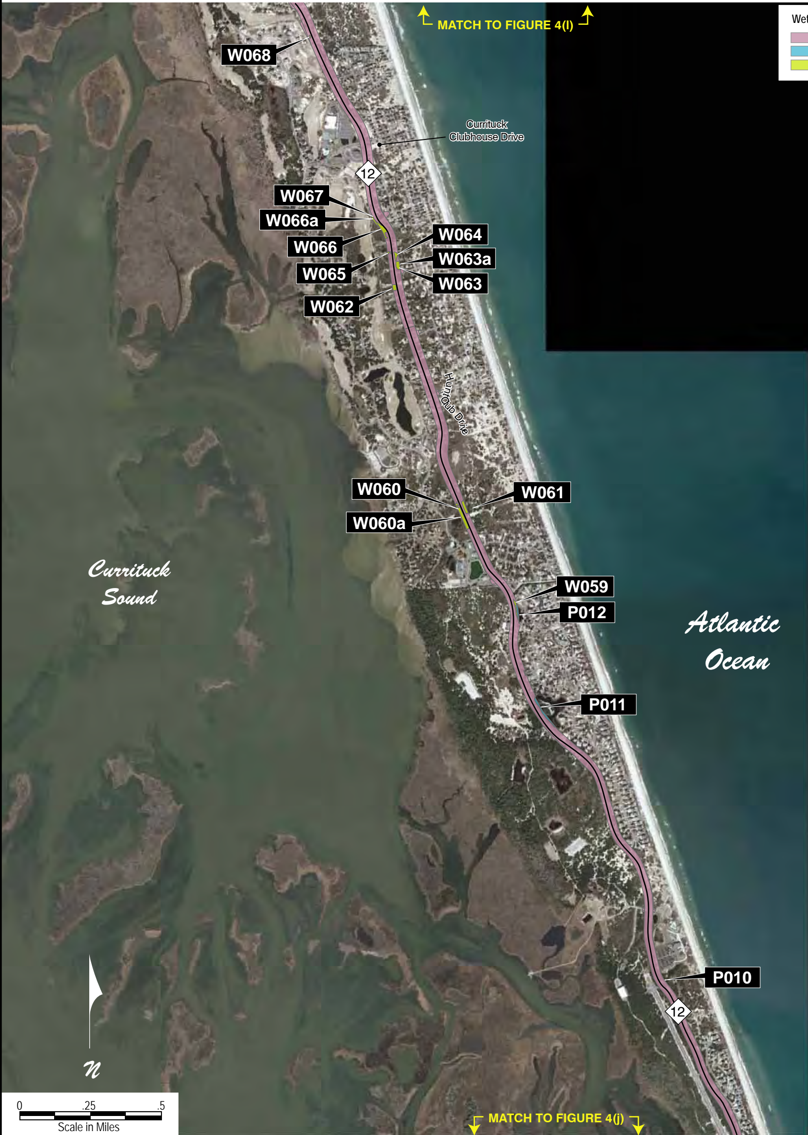
Jurisdictional Features Map